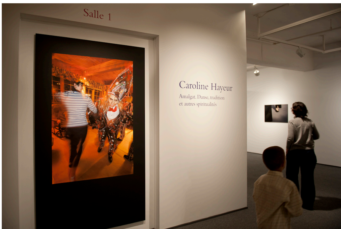
Joliette Museum of Arts, 2010

In the gallery, the body of work is presented in the form of mosaics, creating an imaginary society where all of the communities are mixed using aesthetic criteria of colour, texture, contrast or similarity of gesture instead of being sorted and grouped by ethnicity, religion, genetics or philosophical point-of-view.