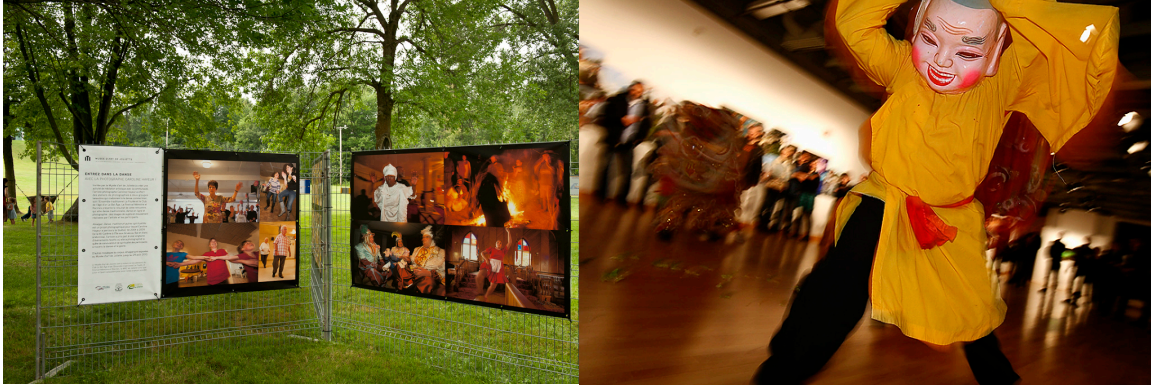
Installation during the festival Mémoires et Racines, Joliette, 2010 Opening with the Montreal Chinese Lion Dance Club, Maison de la culture Côte-des-Neiges, Montreal, 2007

* In the museum, the AMALGAT presentation was enriched by new photographs by the artist and two dance groups from the Lanaudiere region: the folk dance ensemble, La Foulée, from Joliette and the Club Bel-Âge from Notre Dame des Prairies. Also, photo-montages were presented as banners in the museum and throughout the festival.