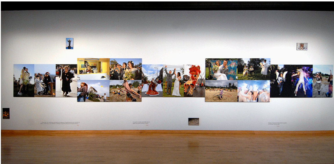
Maison de la culture Côte-des-Neiges, Montréal, 2007

These gatherings take place outside the worlds of work, school or sports, outside of daily family life and outside of home – in public spaces where a “community circle” is constructed. The gatherings serve as necessary outlets and releases, taking place in moments “out of time”.