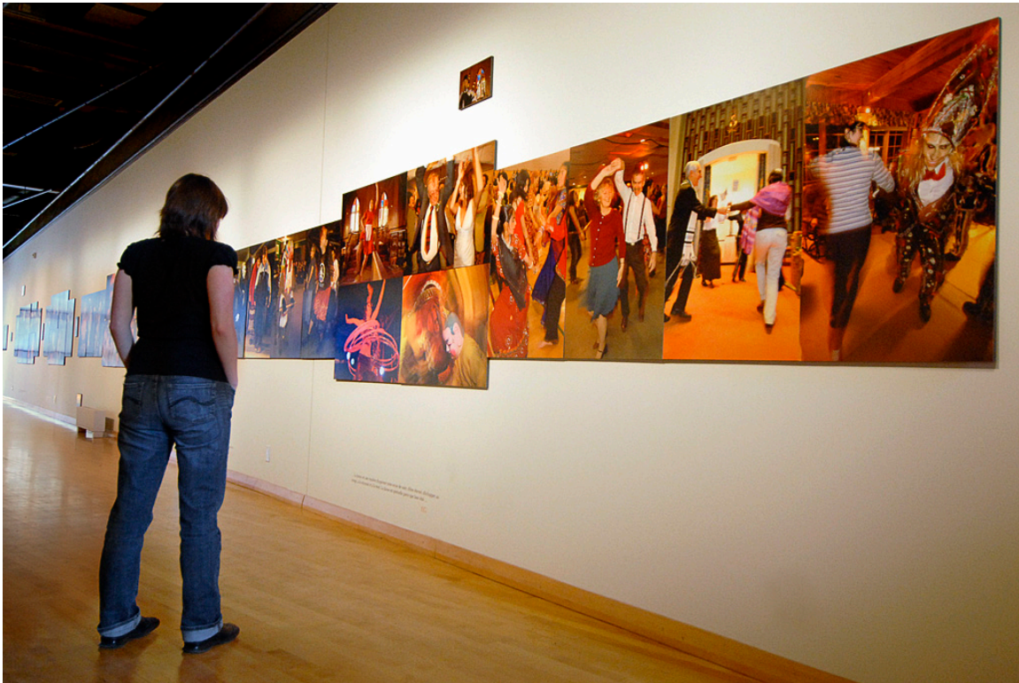
Maison de la culture Côte-des-Neiges, Montréal, 2007